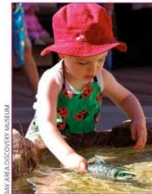
BAY AREA DISCOVERY MUSEUM